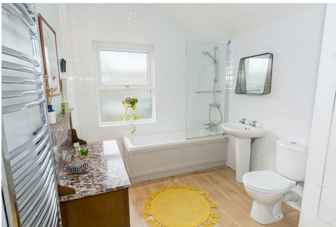
Opaque double glazed window to the rear aspect. Three

piece white suite comprising W/C, wash hand basin, panelled bath with built in shower over and glazed shower screen. There is a cupboard housing the refitted combination gas central heating boiler.