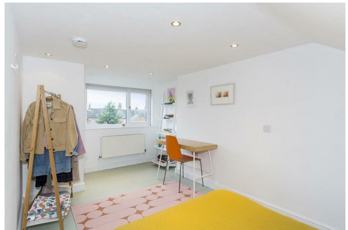
UPVC double glazed window to the rear, radiator and a set of double doors through to the eaves storage space.