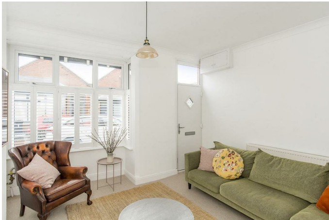
Lounge 13'8" x 12'5" (4.17m x 3.78m)

Enter the property via a composite front door. There is a UPVC door opening into the living room where you find a double glazed box bay fronted window to the front aspect and a radiator. There is an archway through to the dining room.