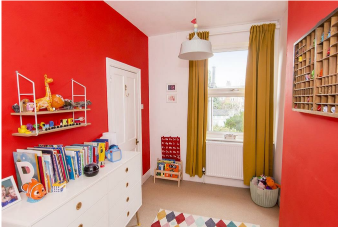
UPVC double glazed window to the rear aspect. Radiator